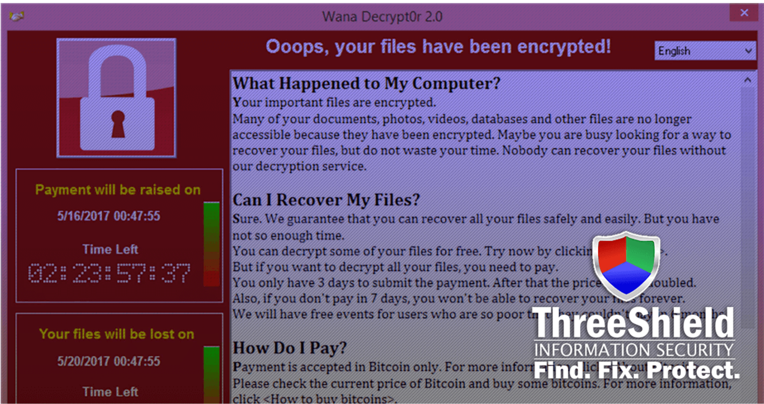
1.Wana Decrypt0r 2.0